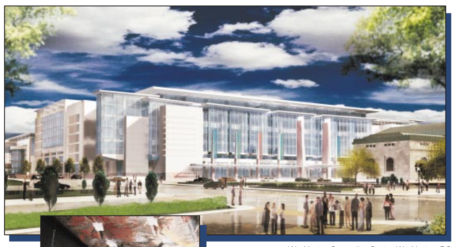
Washington Convention Center, Washington, DC